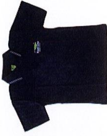
Short Sleeve Polo Top