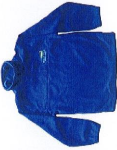
Polar Fleece Top