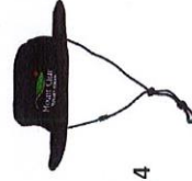
Broadbrimmed Hat Compulsory in Terms 1 & 4