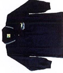
Long Sleeve Polo Top