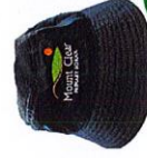
Bucket Hat Compulsory in Terms 1 & 4