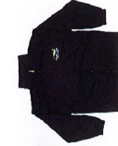
Waterproof Spray Jacket