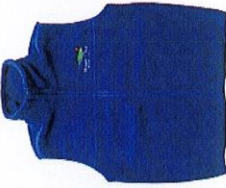
Polo Fleece Vest