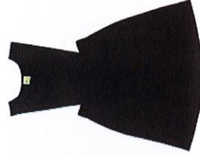
Girl's Winter Dress