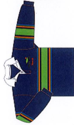
Year 6 Rugby Top