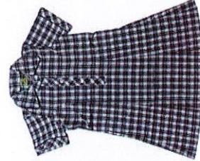
Girl's Summer Dress