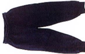
Navy Blue Track Pants