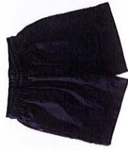
Navy Blue Shorts