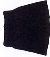
Navy Blue Culottes