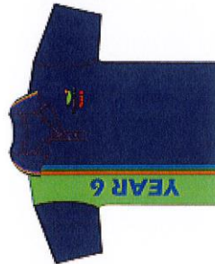
Year 6 Polo Top