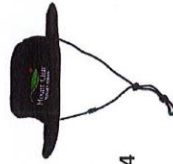
Broadbrimmed Hat Compulsory in Terms 1 & 4