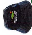
Bucket Hat Compulsory in Terms 1 & 4