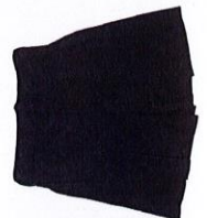
Navy Blue Culottes