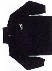
Waterproof Spray Jacket