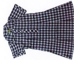
Girl's Summer Dress