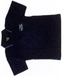
Short Sleeve Polo Top