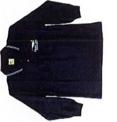
Long Sleeve Polo Top