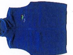
Polo Fleece Vest